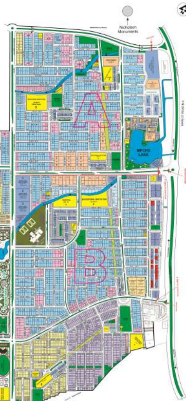
SCHEDULE OF PLOTS